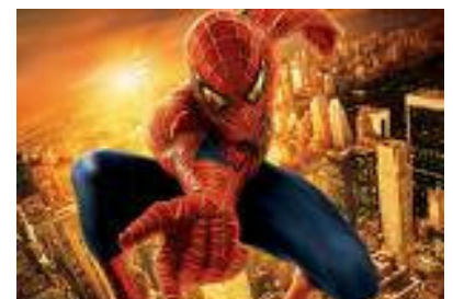
Spidy is out of disguise as he scales the side of the FSA Truck to reach the top!